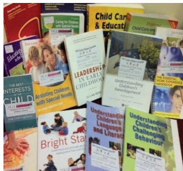
A selection of books from our library

Our library is a valuable source of information for parents, childcare providers and learners. It contains books on a wide list of areas from Child Development, Child Management, Special Needs, Aistear, Siolta, to name but a few. The library has resources on all areas of childcare and provides a number of services for people within the profession. There is an Information Officer dedicated to running the library and is available to answer questions or requests you may have in relation to the library or your information needs. Annual membership is €5. For more information or to join our library please call into our office.