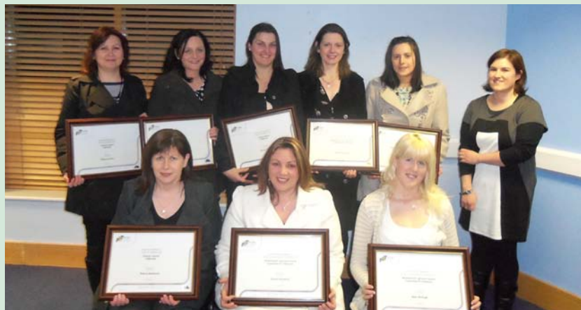
Pictures taken from LCC presentation nights in 2011

FETAC Level 6 childcare modules were also delivered. This training is primarily aimed at owners, managers or those in a supervisory capacity in a childcare setting. 21 gained a Level 6 Supervision in Childcare award with a further 61 component certificates received.